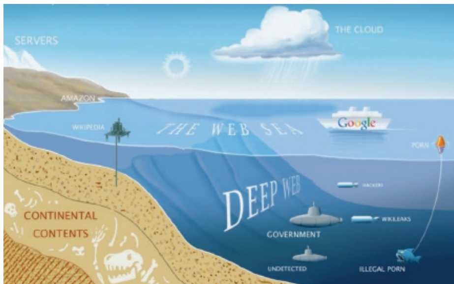
FIGURE 1. The Surface Web vs. the Deep Web